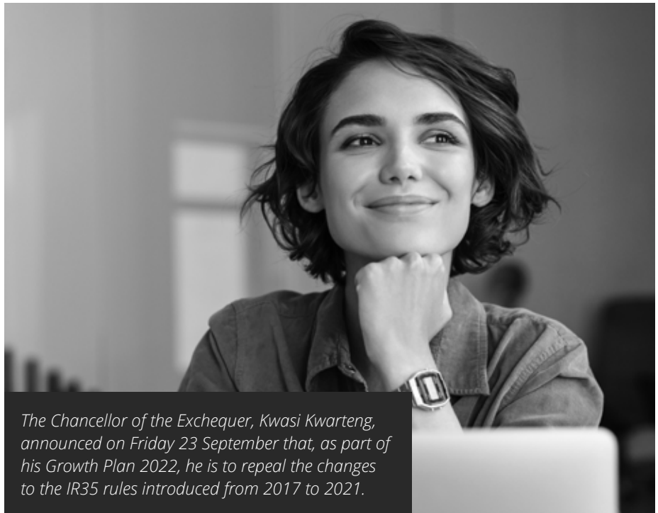
The Chancellor of the Exchequer, Kwasi Kwarteng, announced on Friday 23 September that, as part of his Growth Plan 2022, he is to repeal the changes to the IR35 rules introduced from 2017 to 2021.

Investment Zones will drive growth and unlock housing across the UK through lowering taxes and liberalising planning frameworks to encourage rapid development and business investment. ◀